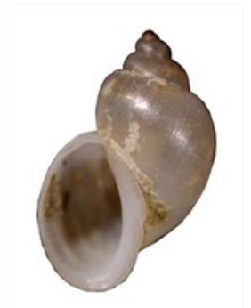
Isidorella egregia (adult size 6-9.5 mm)