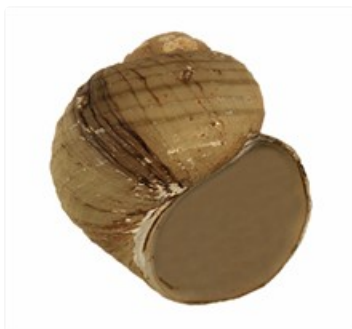
Larina lirata (adult size 15-20 mm)

This species has more distinct spirals than L. strangei , and is pale