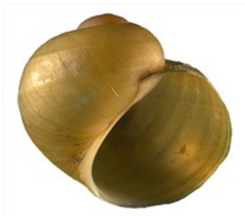
Larina strangei (adult size 15-18 mm)

This species has less distinct spirals than L. lirata and is usually