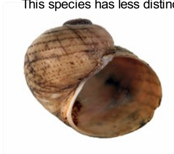
Larina strangei (adult size 15-18 mm)