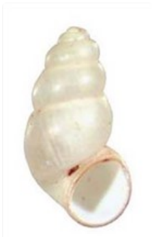
Nanocochlea monticola (adult size 2.1-2.5 mm)