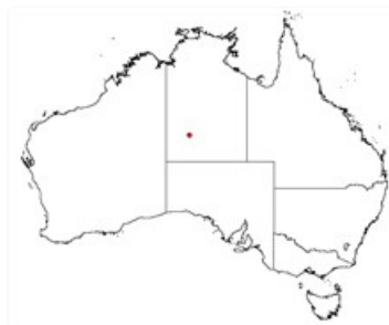
Distribution of Ngaldrobia porrecta .