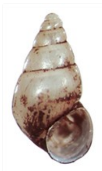
Phrantela conica (adult size 2.8-3.6 mm)