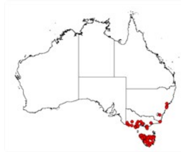
Distribution of Pisidium (Euglesia) tasmanicum .

bent. Pre-siphonal mantle suture short. Outer demibranch posterior. It reaches 4.2 mm in length.