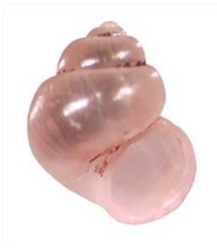
Posticobia norfolkensis (adult size 2.1-2.7 mm)

Posticobia norfolkensis differs from P. brazieri in its general shell