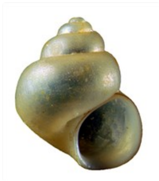
Posticobia ponderi (adult size 1.7-2.6 mm)