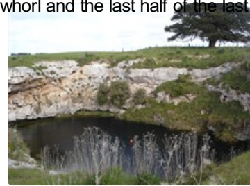
One Tree Sinkhole.