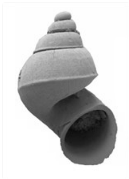
Posticobia species (adult length 2.2-2.6 mm)

This 'species' has a keeled last whorl and the last half of the last whorl