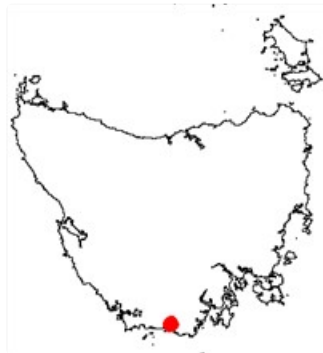
Distribution of Pseudotricula progenitor .