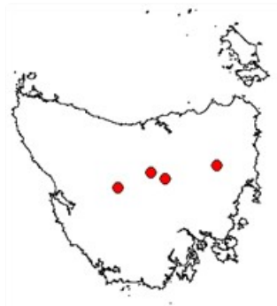
Distribution of Sphaerium (Musculium) lacusedes .