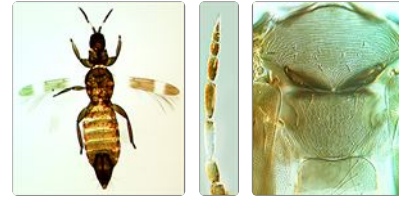
Female Antenna Meso & metanotum

Female macropterous. Body and legs brown; antennal segment III yellow in basal half or two-thirds but brown distally, IV–IX brown; fore wing brown at extreme base but clavus largely pale, with long median brown area and two clear transverse bands; distal transverse band almost parallel-sided with pale costal vein. Head with postocular region as long as eye length; distal maxillary palp segment subdivided. Antennae 9-segmented, III–IV with sensorium curving at or around apex, extending to basal half or basal third of segment, without internal markings. Mesonotum with 3 or 4 pairs of accessory setae medially. Metanotum reticulate, with internal dot-like markings.