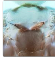
Meso & metanotum