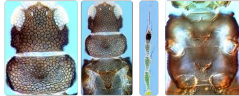
Head and pronotum