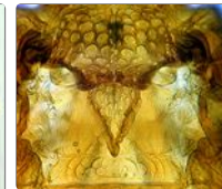
Mesonotum and metanotum