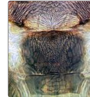
Mesonotum and metanotum