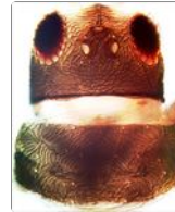
Head and pronotum