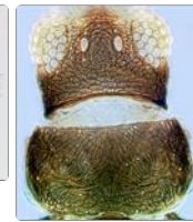
Head and pronotum