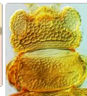
Head and pronotum