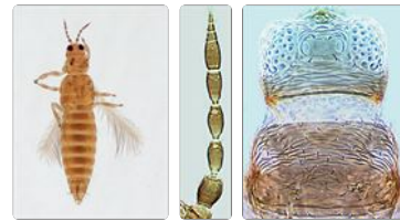
Female Antenna Head & pronotum

Male macroptera. Similar to female; tergite VIII with two pairs of small stout setae medially; sternites III–VI with small C-shaped pore plate.