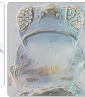
Head & pronotum