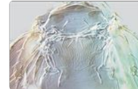
Meso & metanotum

Male macroptera. Similar in colour and sculpture to female but smaller; tergite IX with pair of short dark drepanae; aedeagus apparently without spines.