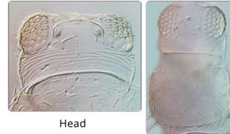
Head Head & pronotum