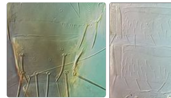
Tergites VIII–IX Sternites VI–VII