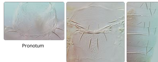
Pronotum Meso & metanotum Tergites V–VI