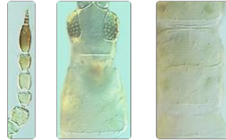
Antenna Head & pronotum Meso & metanotum