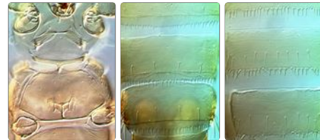
Thoracic sternites Tergites VI–VIII Sternites