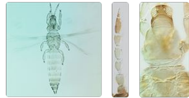
Female Antenna Head & thorax

Female macroptera. Body light brown with median abdominal segments paler; antennal segments II–IV yellow; fore wings pale with second quarter shaded. Antennae 8-segmented, I with paired dorso-apical setae, sense cone on III–IV simple. Head elongate, cheeks incut behind eyes; ocellar setae pair I absent; compound eye with about 6 weakly pigmented facets; mouth cone large, extending between fore coxae, maxillary palps 3-segmented. Pronotum without sculpture, apart from posterior sub-marginal line; 4 pairs of posteromarginal setae, none elongate. Prosternal ferna weakly joined medially; meso and metafurca without spinula. Metanotum with complex sculpture. Fore wing first vein with 3 + 2 + 2 setae; second vein with 8 setae; clavus with 4 veinal and one discal setae; posterior cilia strongly wavy. Abdominal tergites without sculpture medially, no ctenidia laterally; VIII with no marginal comb; IX with one pair of campaniform sensilla, X with no dorsal split. Sternites II–VII each with 3 pairs of marginal setae, often arising sub-marginally, no discal setae; ovipositor very weak. Male not known.