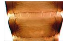
Abdominal sternite VI