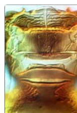
Meso & metanota, tergite II