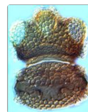
tumiceps head & pronotum