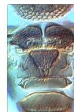
tumiceps meso & metanota