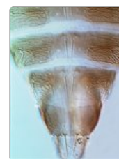
minowai tergites VI-X