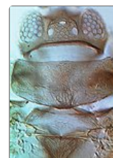
minowai head & pronotum