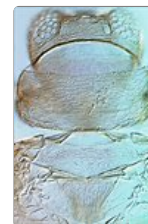
sexmaculatus head & pronotum