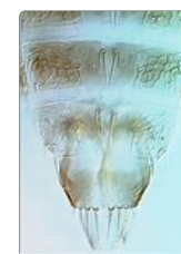
stannardi tergites V-X