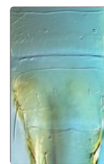
sacchari tergites VII-IX