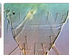
chrysis tergites VIII–IX