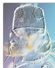
chrysis head & pronotum