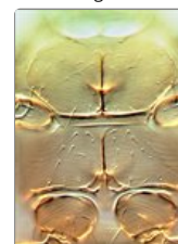
consociatus meso & meta furca