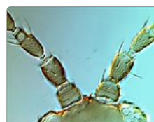
consociatus dorso-apical setae on antennal segment I