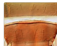
consociatus tergites VII–VIII