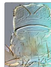
glycines head & pronotum