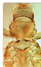
consociatus head & thorax