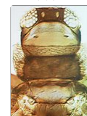
Neohydatothrips magnoliae head and pronotum