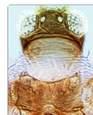
Neohydatothrips samayunkur head & pronotum