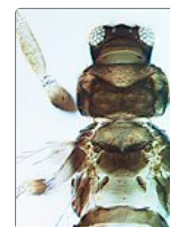
Neohydatothrips gracilicornis head and thorax