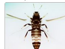
Neohydatothrips magnoliae female