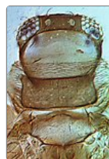
Neohydatothrips flavicingulus , head & pronotum