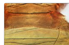
indicus tergite II