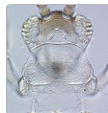
bhattii head & pronotum [M.Masumoto]