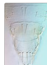
mori tergites VII-X