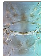
pardalotus pro, meso & metanota