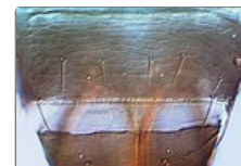
longistylosus tergite VIII