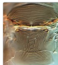
aimotofus meso & metanota