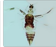
Scolothrips asura female