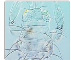
Scolothrips rhagebianus head & pronotum