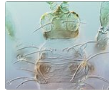
Scolothrips latipennis head & pronotum