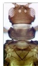
rubrocinctus head & thorax