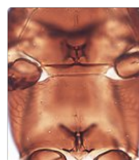
Meso &amp; metasterna