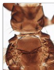
Pronotum &amp; metanotum