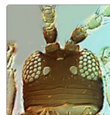
yangtzei head & fore tibiae