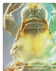
pasekamui head & pronotum