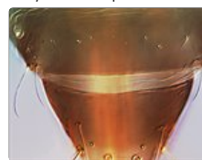
pasekamui tergites VIII-IX