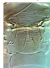
pasekamui meso & metanota