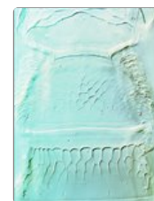
Zaniothrips meso & metanotum Zaniothrips tergites I-III