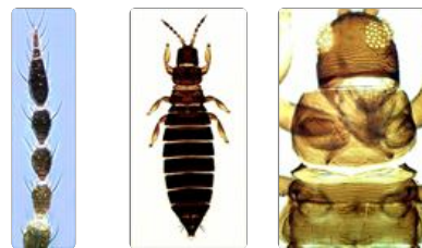
apteris antenna apteris female apteris head & thorax

Male similar to female; glandular opening between sternites II–III; tergite IX with two pairs of spine-like setae.