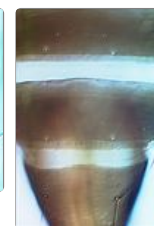
venustus tergites VII-IX