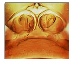
fasciatus hind coxae