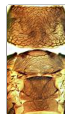
insularis pro, meso & metanota