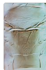
claratris meso & metanota