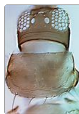
claratris head & pronotum

Female macropterous. Head with three pairs of ocellar setae; pair I with the two setae usually arising one in front of the other; ocellar setae pair III arising within ocellar triangle; maxillary palps 3-segmented; eyes without or with five pigmented facets. Antennae 8-segmented, segment I with paired dorso-apical setae; segments III and IV with forked sense cones; III–VI with microtrichia on both surfaces. Pronotum with two pairs of posteroangular setae, 3–4 pairs of posteromarginal setae. Mesonotum with median setae close to posterior margin, anterior campaniform sensilla present or absent. Metanotum reticulate, median setae at anterior margin, campaniform sensilla present or absent. Fore wing first vein with about seven setae basally, two setae distally; second vein with complete row; discal seta present or absent on clavus. Prosternal ferna entire, basantra without setae; mesothoracic sternopleural sutures complete, mesofurcal spinula present, metafurcal spinula absent. Tarsi 2-segmented. Tergites without ctenidia, median setae far apart, VI–VII with setae S3 much smaller than S4; tergite VIII posterior margin with complete comb of microtrichia; IX with two pairs of campaniform sensilla; X with complete dorsal split. Sternites III–VI with 3 pairs of marginal setae, VII with S1 and S2 arising well in front of posterior margin. Male tergite IX with median setae slender or slightly stout; sternites III–VII with 2 or more rows of small pore plates.