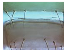
claratris sternite VII