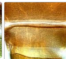
corbetti tergite VIII