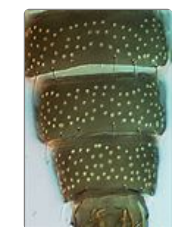
americanus male sternites