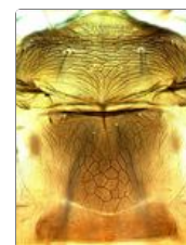
americanus meso & metanota