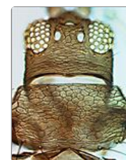
americanus head & pronotum