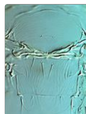
antilope meso & metanota