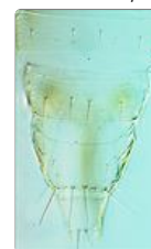
antilope tergites VII-X